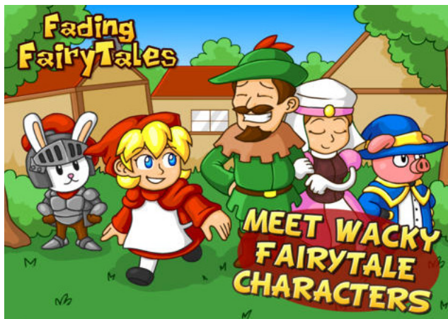
Fading Fairytales. Testing, design.